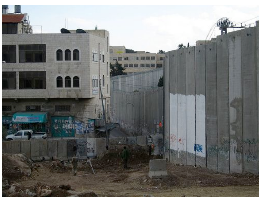
(Security Barrier at Abu Dis)

From there we drove through Arab East Jerusalem and into Abu Dis, where the security barrier, here very much a wall, is simply a fact of the life. We viewed one incomplete section, where apparently thousands of Palestinian workers and students jump over a low-lying section of the wall every day. There was another section of the barrier, also still unfinished, which we could see was going to go directly between two homes. Apparently, one home had successfully petitioned to be on the Israeli side of the barrier, and the other had not. Graffiti on the barrier read, "Not for another Wailing Wall."