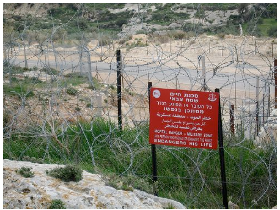
(Warning sign in front of the security barrier in Bethlehem)

From there we drove through Arab East Jerusalem and into Abu Dis, where the security barrier, here very much a wall, is simply a fact of the life. We viewed one incomplete section, where apparently thousands of Palestinian workers and students jump over a low-lying section of the wall every day. There was another section of the barrier, also still unfinished, which we could see was going to go directly between two homes. Apparently, one home had successfully petitioned to be on the Israeli side of the barrier, and the other had not. Graffiti on the barrier read, "Not for another Wailing Wall."