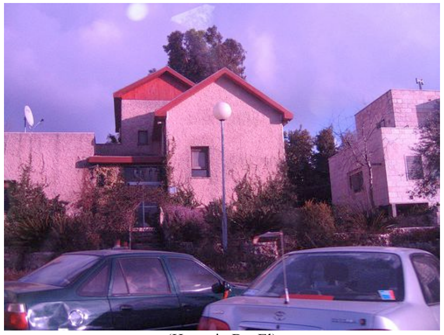
(Home in Bet El)

We stopped at a gas station outside Ofra, an Israeli settlement rather deep in the West Bank. We wanted to go in, but the guards were checking ID's and our Israeli-Arab driver didn't think he would be very welcome. We turned around and headed towards Bet El, another settlement right next to Ramallah. The guards there let us in without question, so we were able to drive into one of the oldest settlements in the West Bank (almost 30 years old). The biggest surprise about Israeli settlements in the West Bank was that they look just like Israeli towns inside the Green Line. The homes are quaint, made of beautiful Jerusalem stone and surrounded by manicured lawns. There are schools, buses, children, synagogues. Except for being surrounded by Palestinian towns and guarded by Israeli soldiers at all times, you would never know you were in the West Bank.